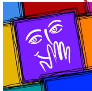
Figure of speech

unusual, arrangement, words, sounds, alliteration, anadiplosis.